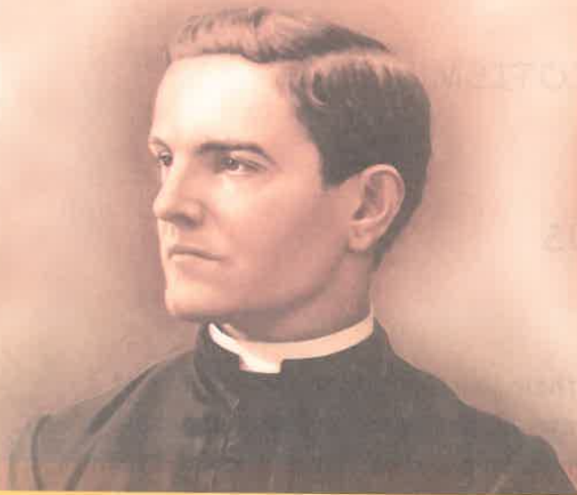
FATHER MICHAEL J. MCGIVNEY, FOUNDER, KNIGHTS OF COLUMBUS

Father Michael J. McGivney founded the Knights of Columbus in 1882 at St. Mary's in New Haven, CT. as an organization committed to Unity as a Catholic lay organization, Charity to those in need and Fraternity with fellow brother knights.